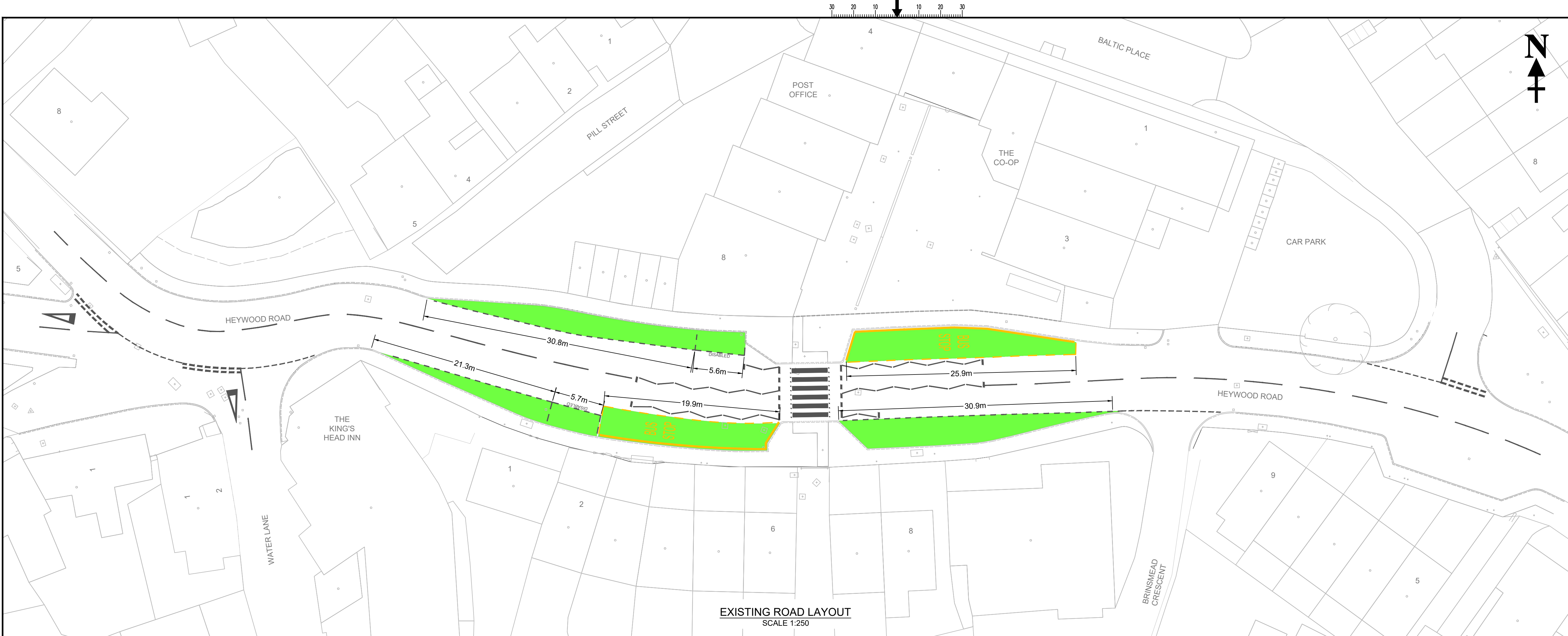
EXISTING ROAD LAYOUT SCALE 1:250