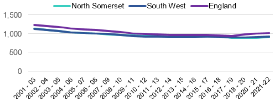
Mortality rate from all causes, all ages (Persons, 3 year range, rate per 100,000)