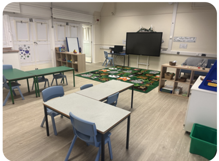
Picture: Milton Park Primary's Resource Base