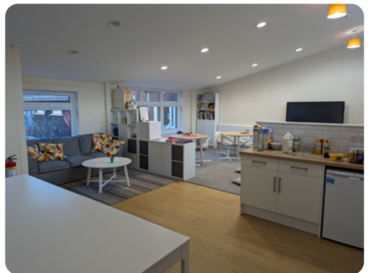
Picture: Crockerne CE Primary School's Nurture Group space