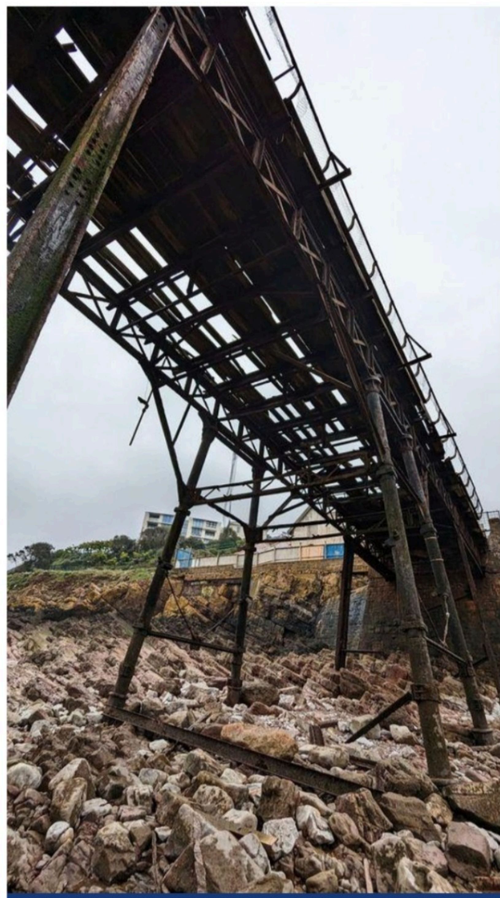
Birnbeck Pier.

The foundation stone was laid in 1864, ready for the pier to open in 1867.