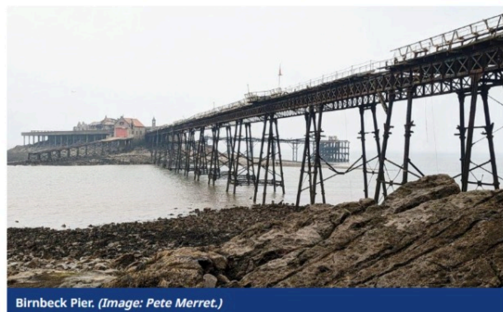
Birnbeck Pier.