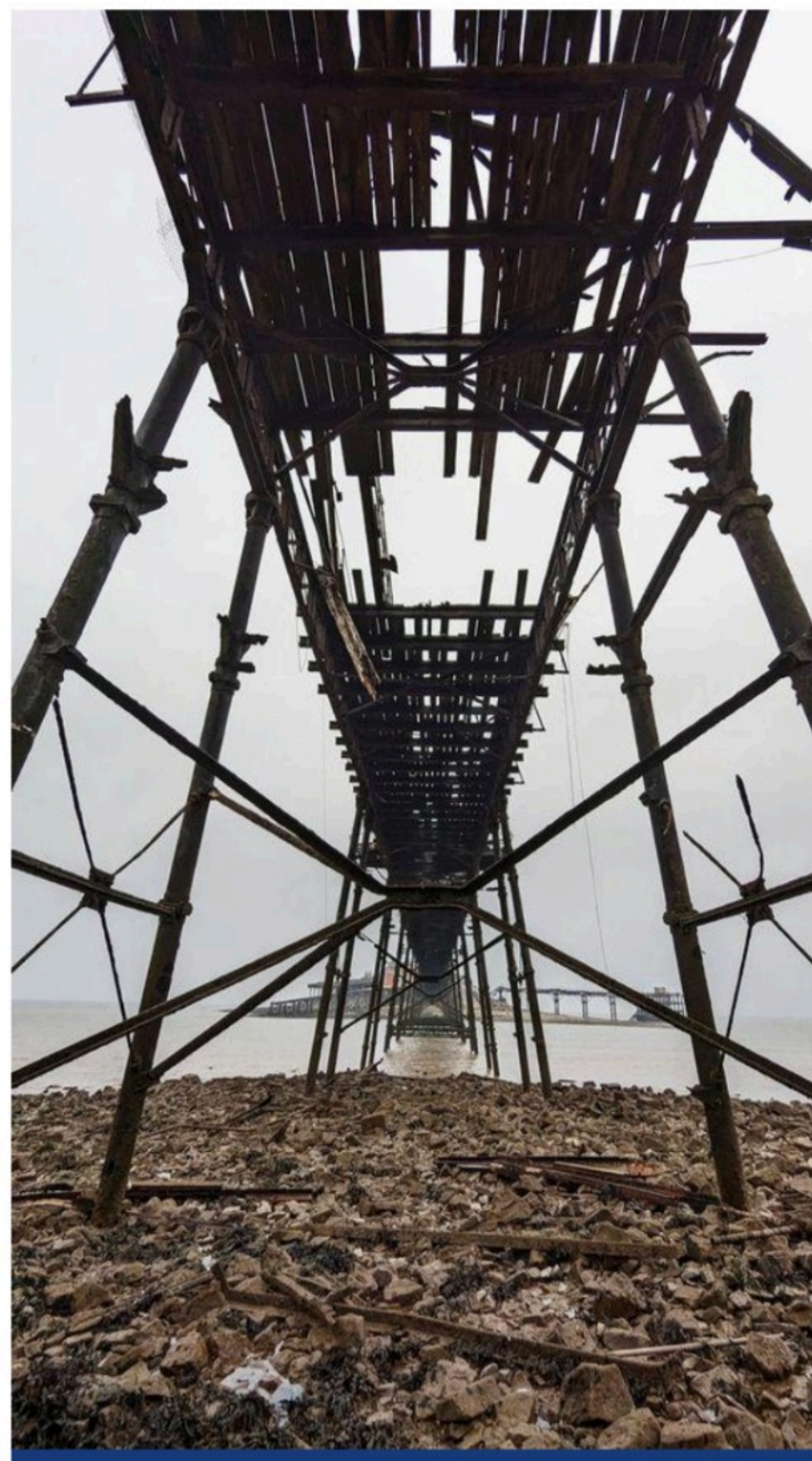
Birnbeck Pier.

As stated on the Birnbeck Regeneration Trust website , the pier itself is 20 feet wide and 1040 feet long, and acts as a crucial part of Weston's heritage.