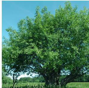
Salix fragilis : Crack willow