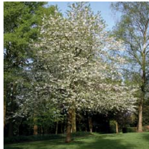
Prunus avium : Wild cherry