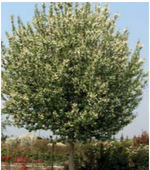
Prunus padus : Bird cherry