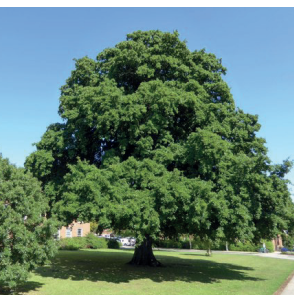
Quercus robur : English oak