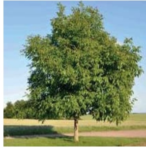
Juglans regia : English walnut