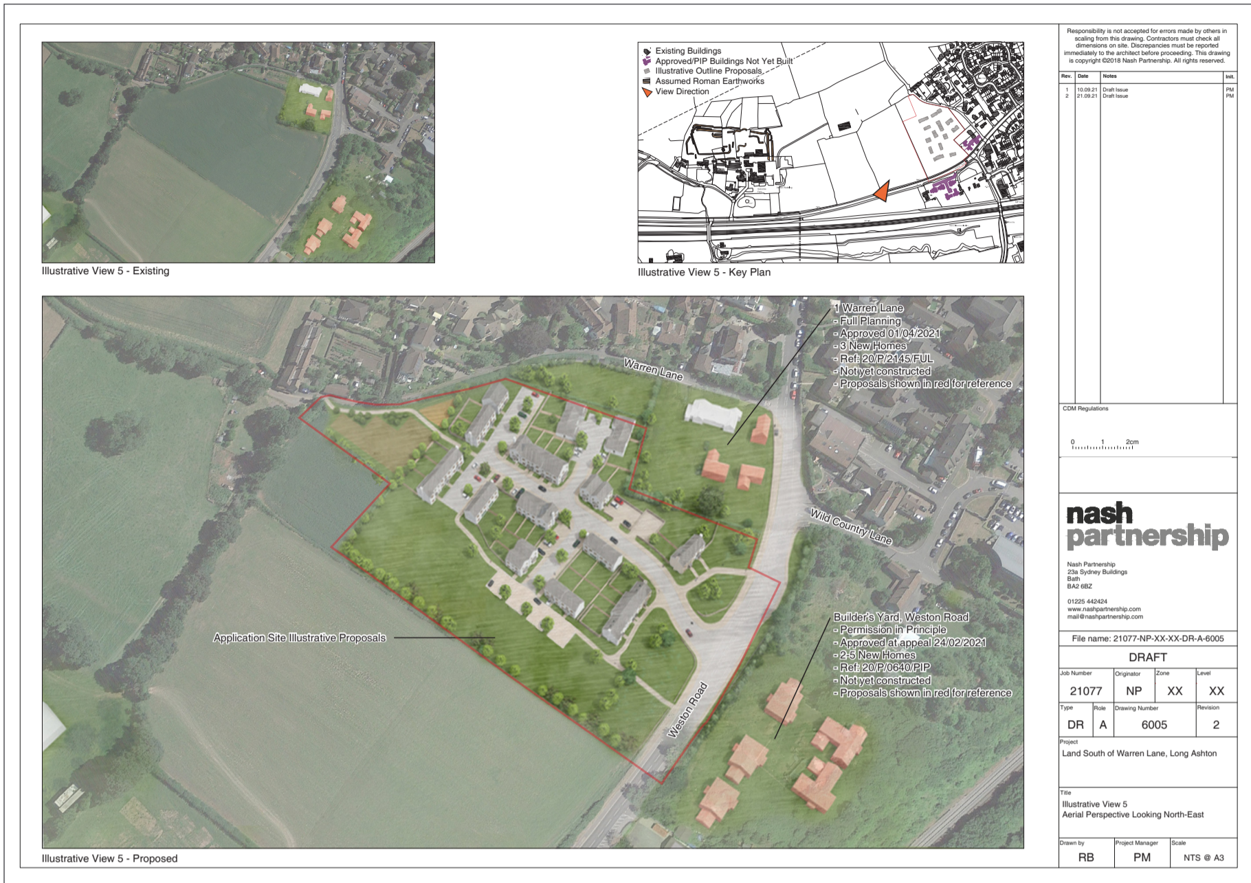
Figure 5.17: Page 5