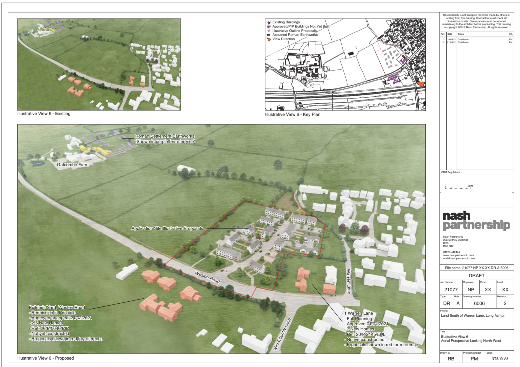
Figure 5.18: Page 6