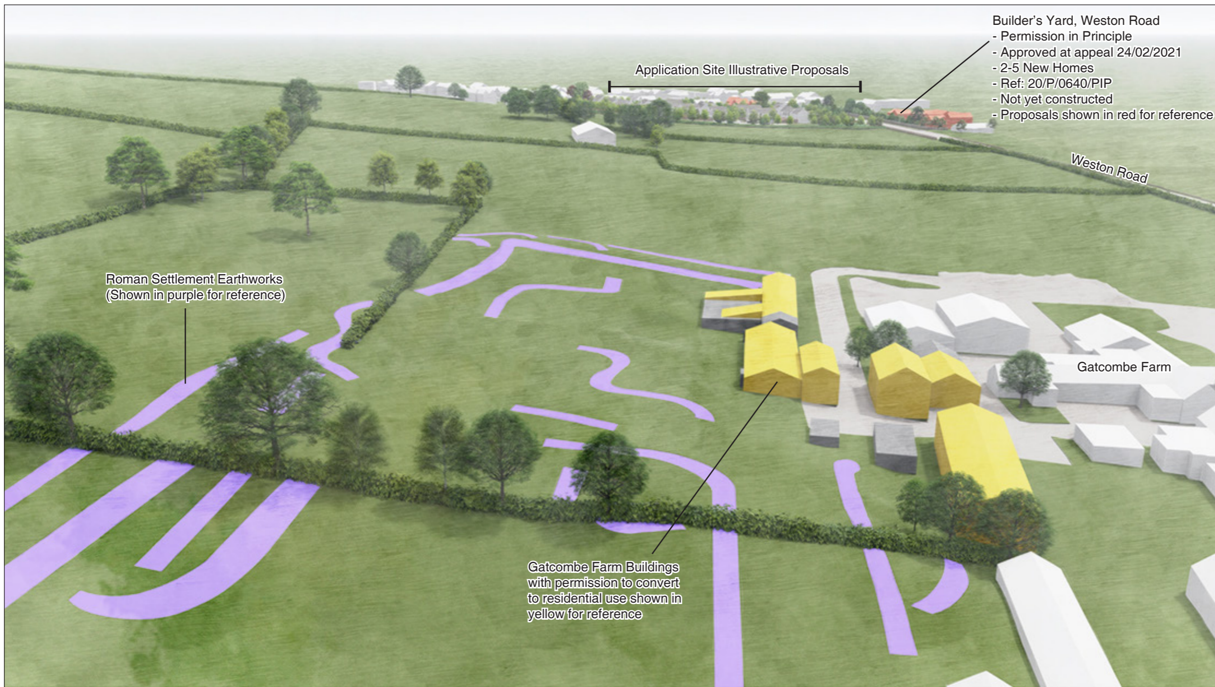
Illustrative View 7 - Proposed

Responsibility is not accepted for errors made by others in scaling from this drawing. Contractors must check all dimensions on site. Discrepancies must be reported immediately to the architect before proceeding. This drawing is copyright ©2018 Nash Partnership. All rights reserved.