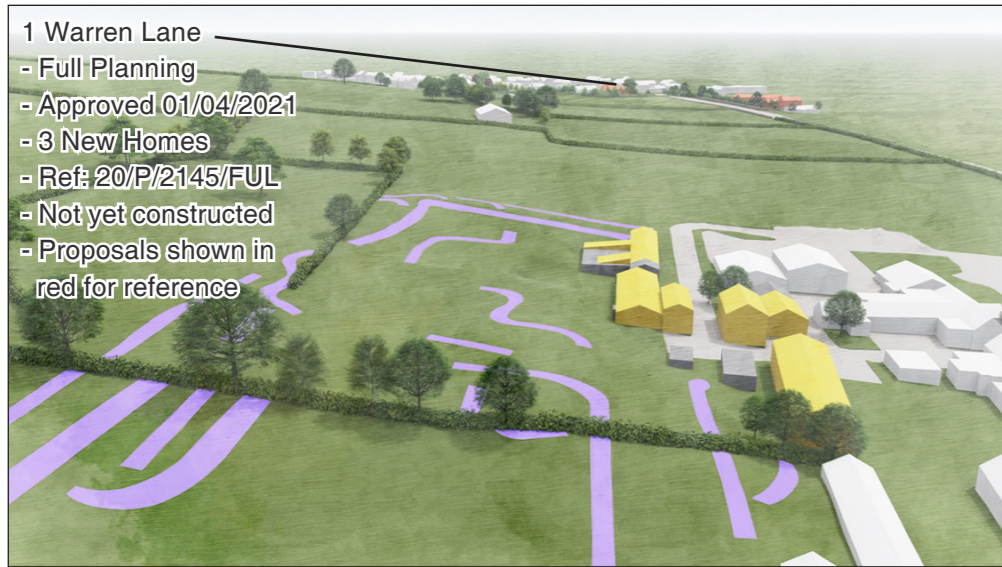
Illustrative View 7 - Existing