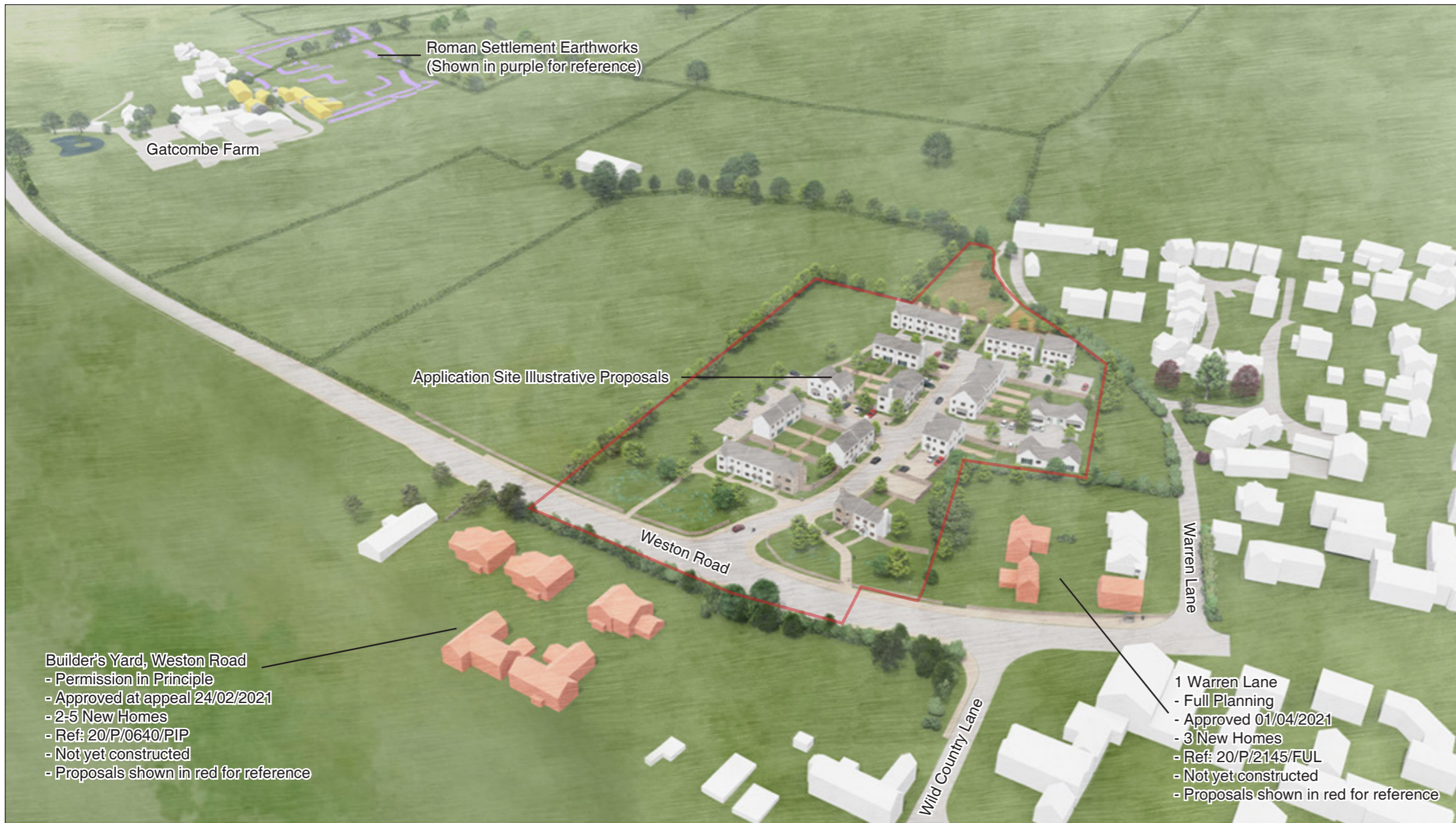
Illustrative View 6 - Proposed

Responsibility is not accepted for errors made by others in scaling from this drawing. Contractors must check all dimensions on site. Discrepancies must be reported immediately to the architect before proceeding. This drawing is copyright ©2018 Nash Partnership. All rights reserved.