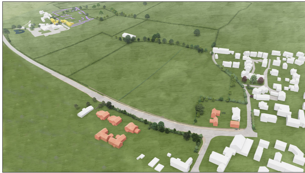
Illustrative View 6 - Existing