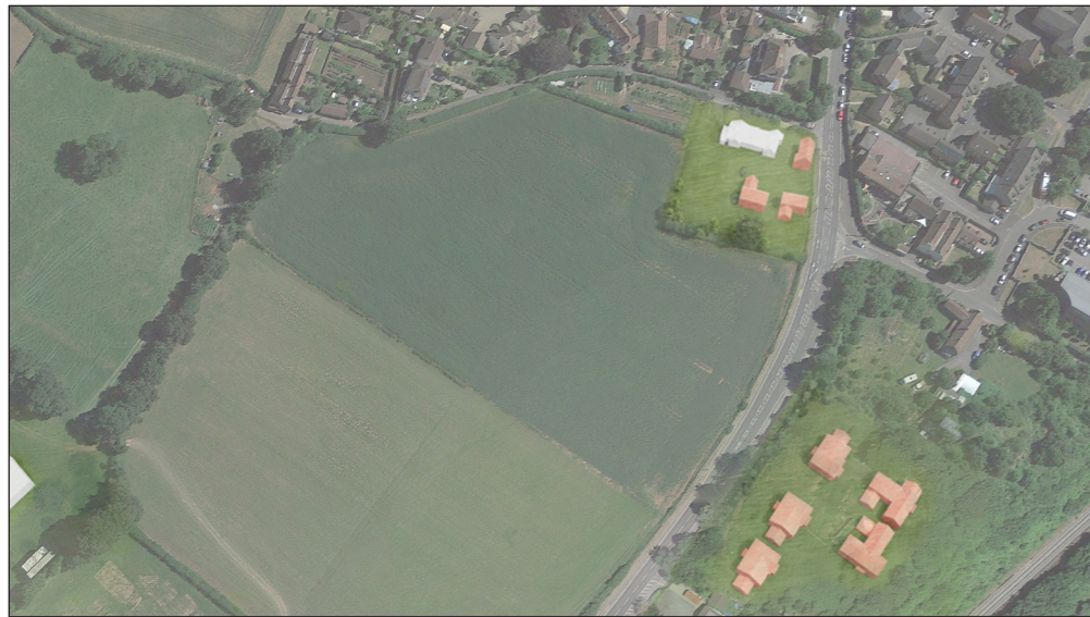
Illustrative View 5 - Existing