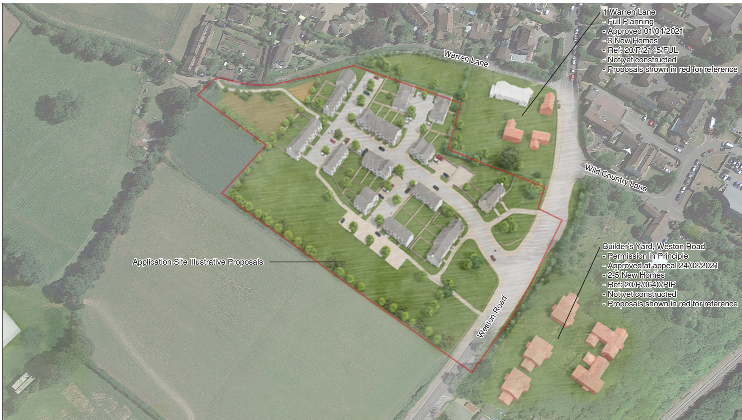
Illustrative View 5 - Proposed

Responsibility is not accepted for errors made by others in scaling from this drawing. Contractors must check all dimensions on site. Discrepancies must be reported immediately to the architect before proceeding. This drawing is copyright ©2018 Nash Partnership. All rights reserved.