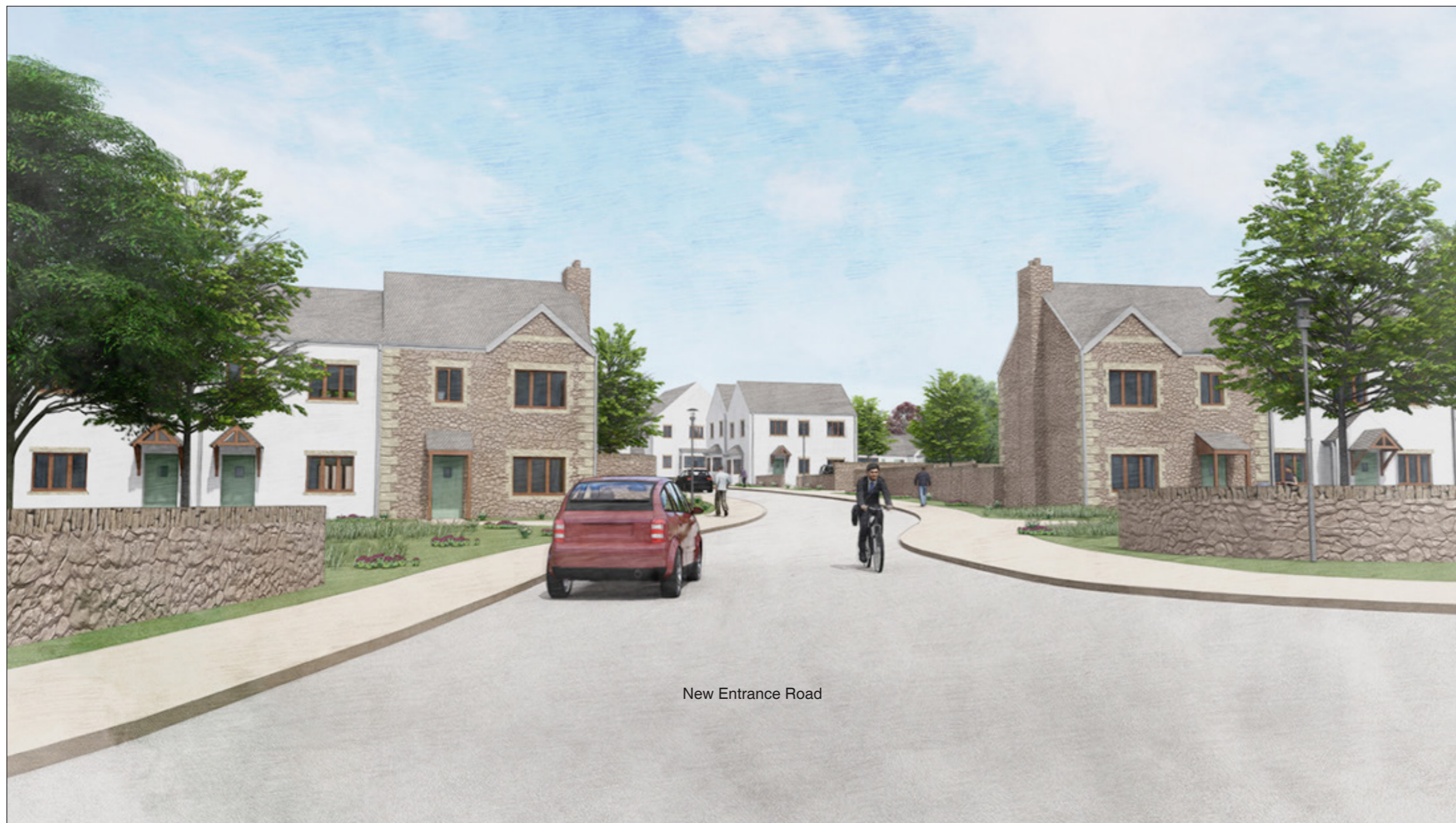
New Entrance Road