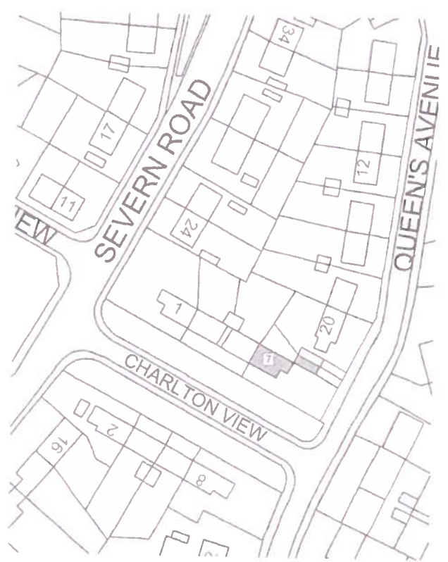
Site Location Plan 1:1250