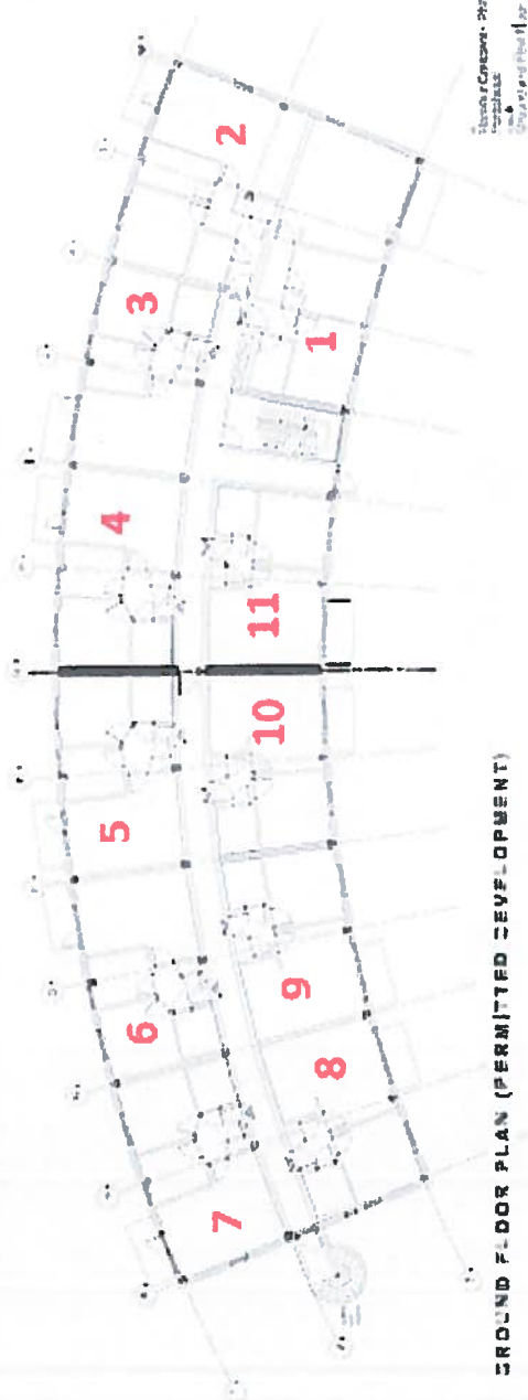
GROUND FLOOR PLAN (PERMITTED DEVELOPMENT)