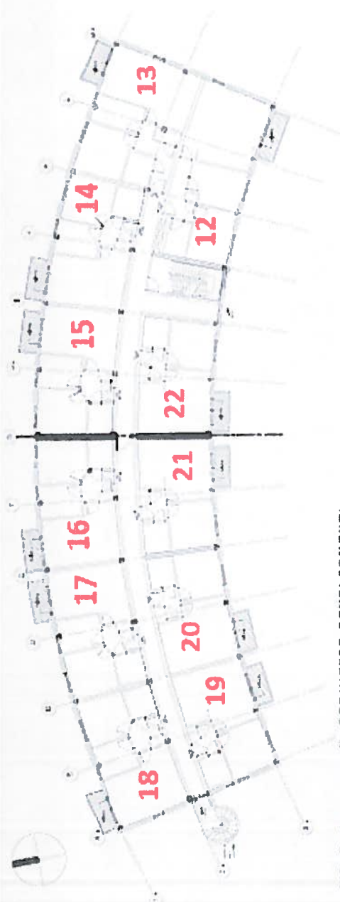
FIRST FLOOR PLAN (PERMITTED DEVELOPMENT)