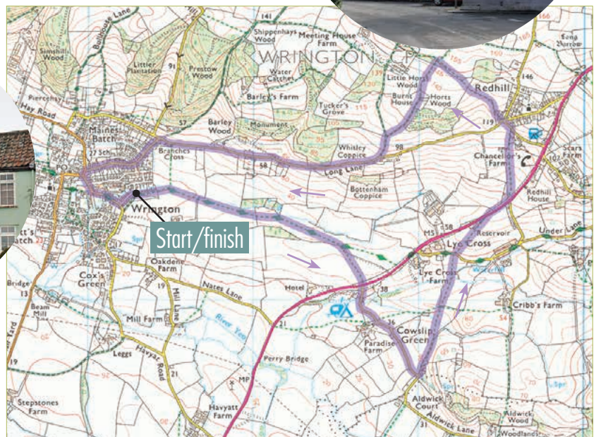
You are not permitted to copy, sub-license, distribute or sell this data to third parties in any form.