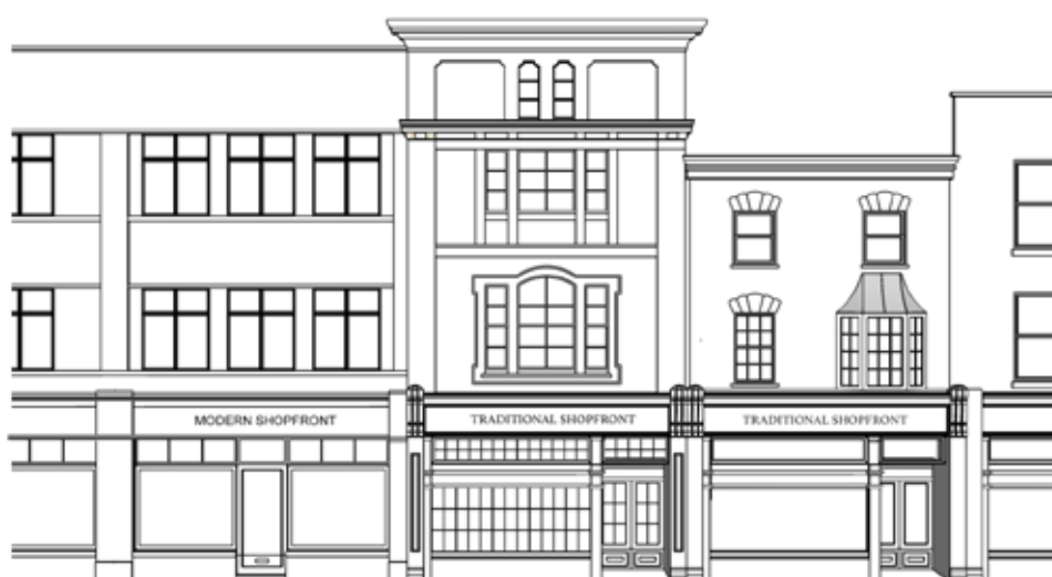
Figure 3 Shopfronts that relate well to the building façade and street

Over time, alterations to shopfronts can lead to a loss of unity in a building's appearance, which can result in a loss of harmony and/or cohesion across a group of buildings. When altering shopfronts, businesses and owners should aim to restore cohesion across architectural lines and design features. Efforts should be made to establish visual order across all stories of a building or facade, as opposed to focusing on the ground floor shopfront in isolation.