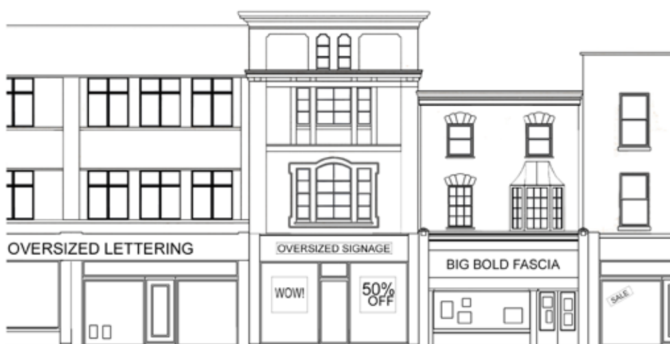
Figure 4 Shopfronts that have little or no cohesion with inappropriate alterations

Where opportunities exist to improve unity across a façade or group of buildings, North Somerset Council will work with business and property owners to ensure consistency in design as part of the planning process. Where site wide improvements are required, for instance in a conservation area, the council may use planning conditions to secure improvements to the development.