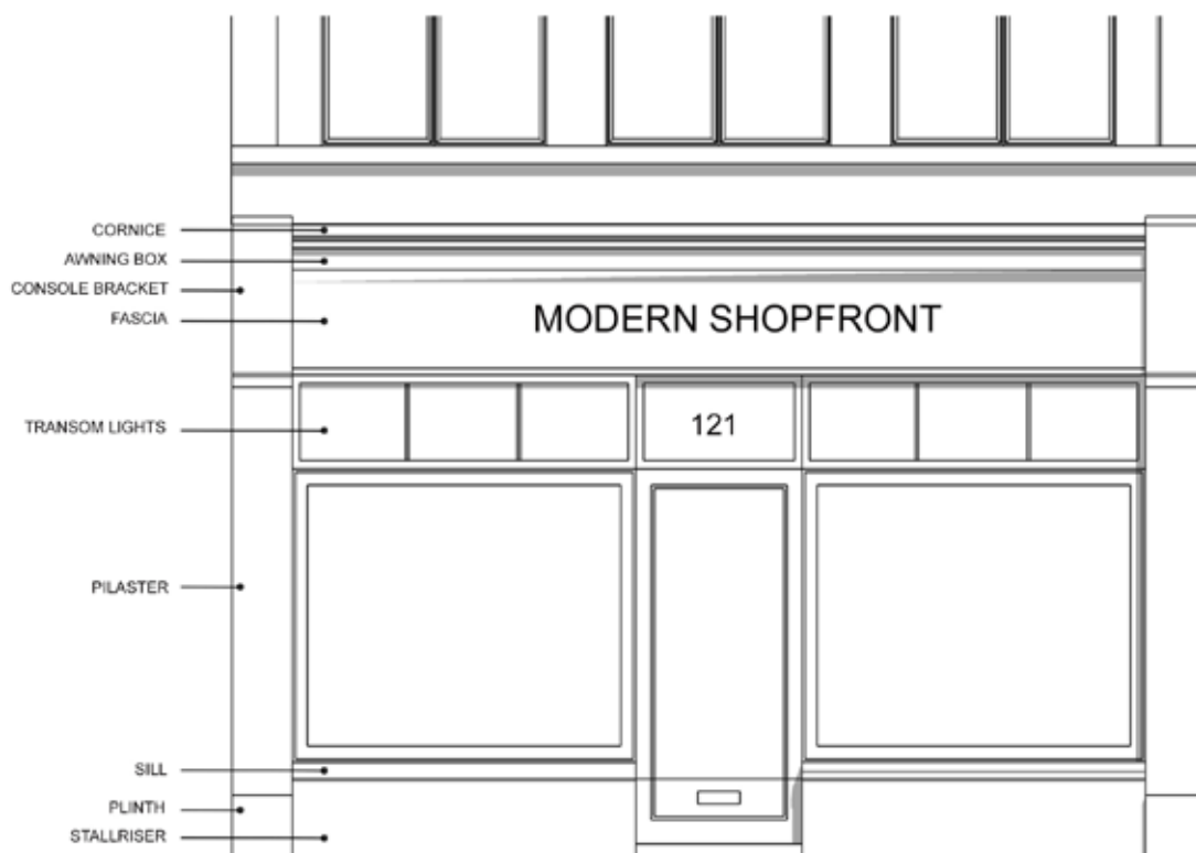
Figure 2 Appropriate new shopfront design