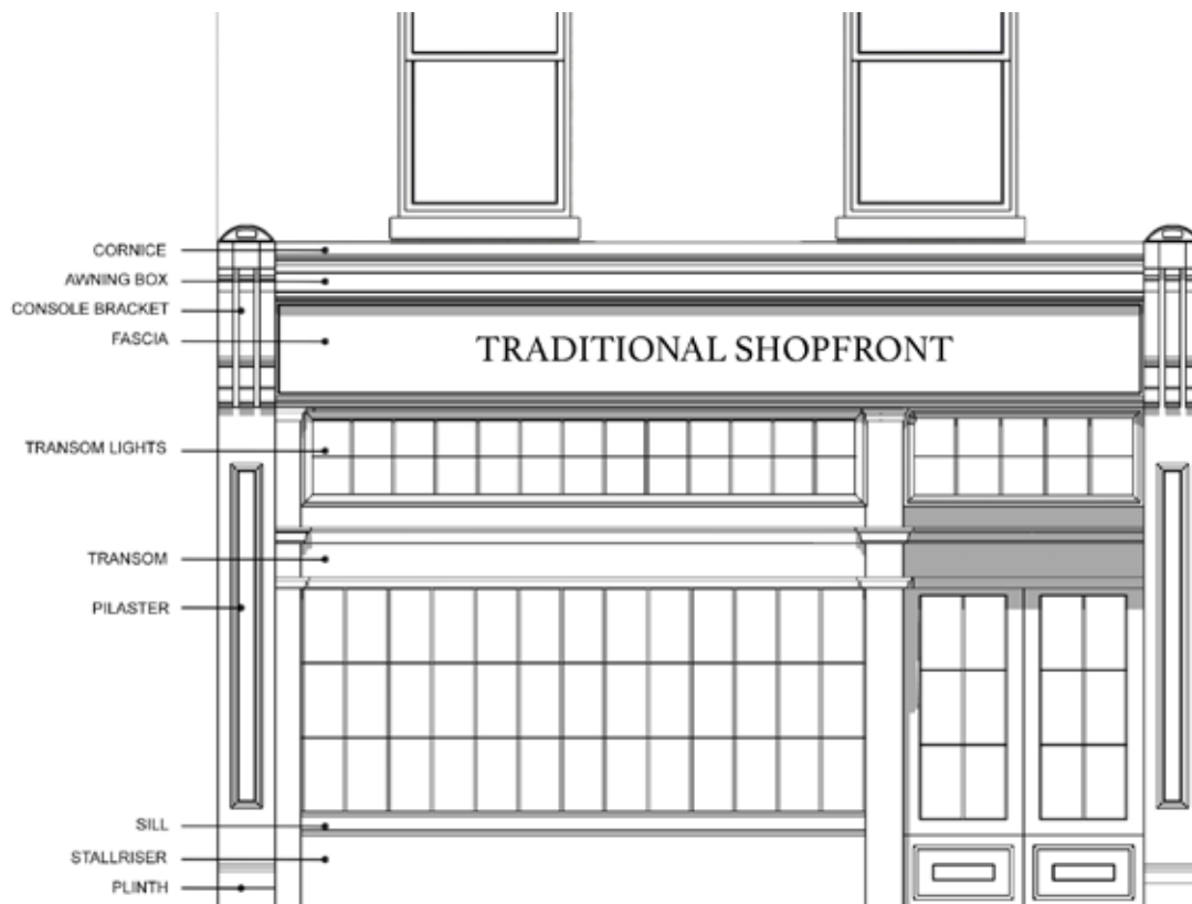
Figure 1 Key components of a traditional shopfront

The typical components of a modern shopfront are highlighted (fig.2) and a modern design approach will be appropriate where the setting or building suits this situation. Locations such as